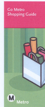
Go Metro Shopping Guide