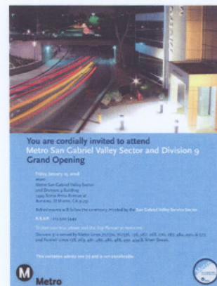
San Gabriel Sector Office Opening