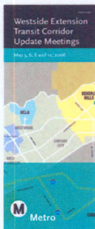
Transit Corridor Meetings

This In the Public Eye report visually recaps communications activities from May 2008. Below are images of some of the campaigns that ran during the month: