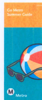
Metro Summer Guide