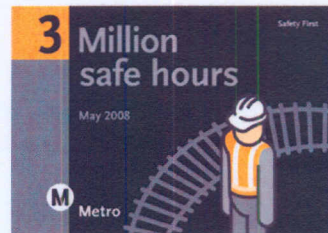
Metro Gold Line Eastside Extension