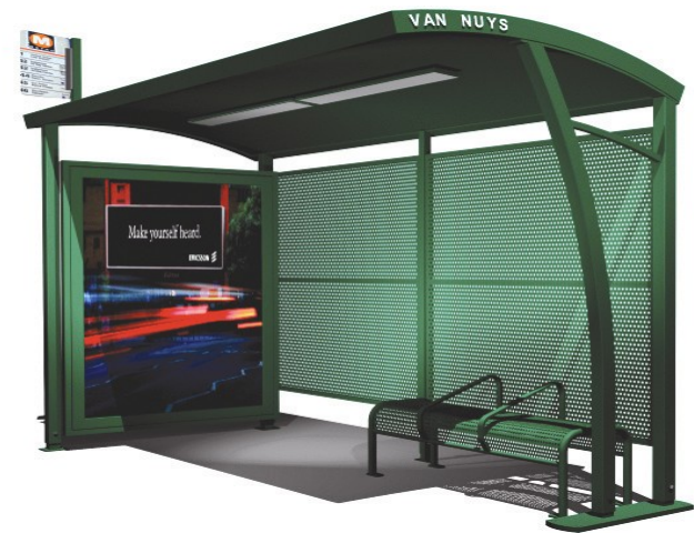
Boulevard Collection (Approximately 90 percent of newly installed shelters)