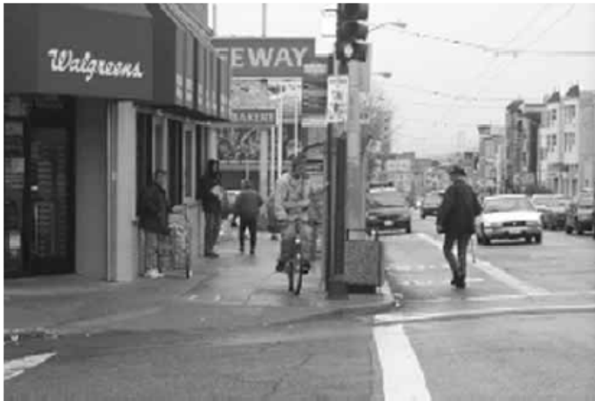
Figure 17. Corner of Mission Street at 30th Street (bus bay configuration).