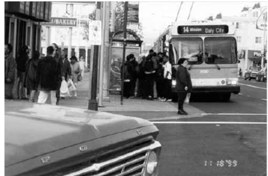
Figure 19. Corner of Mission Street at 30th Street (bus bulb configuration).