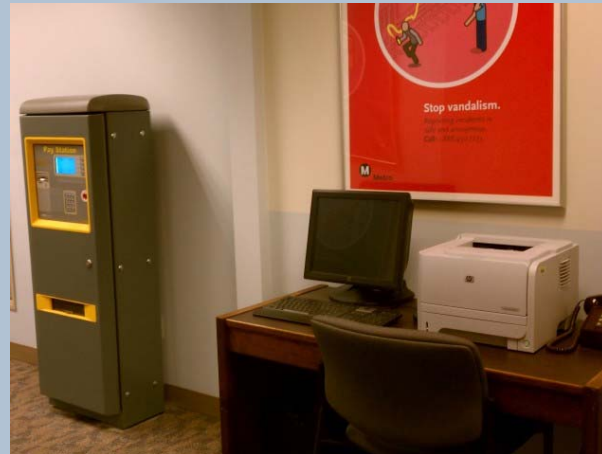
Payment Options Online, Cash Kiosk and Telephone