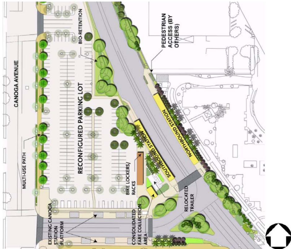
Locally Preferred Alternative from Final EIR