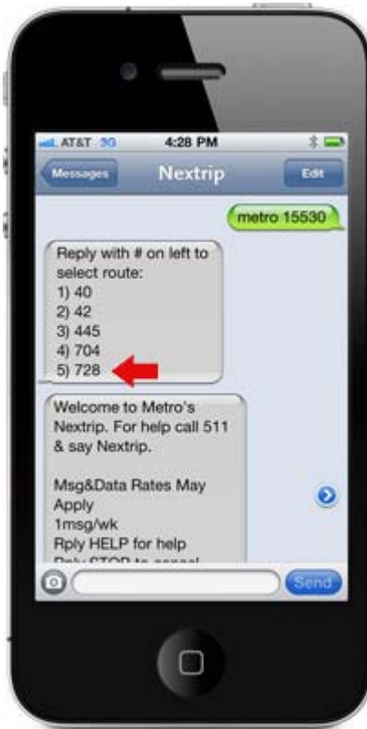
Select Bus Line