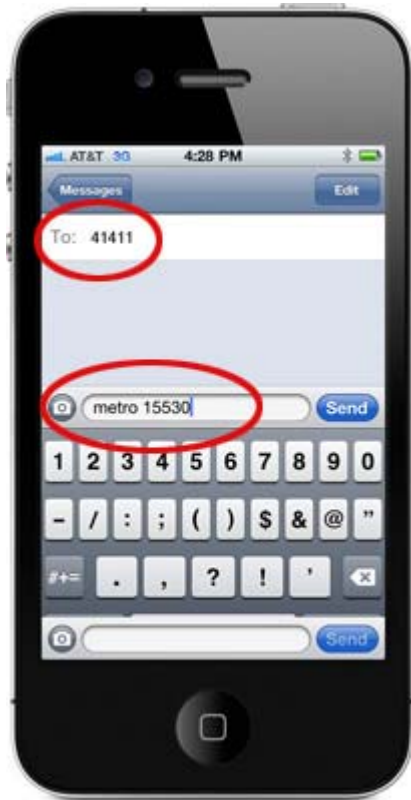
Text 'metro Stop#' to 41411