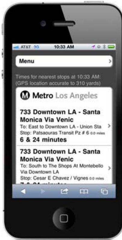
GPS-Enabled Web App