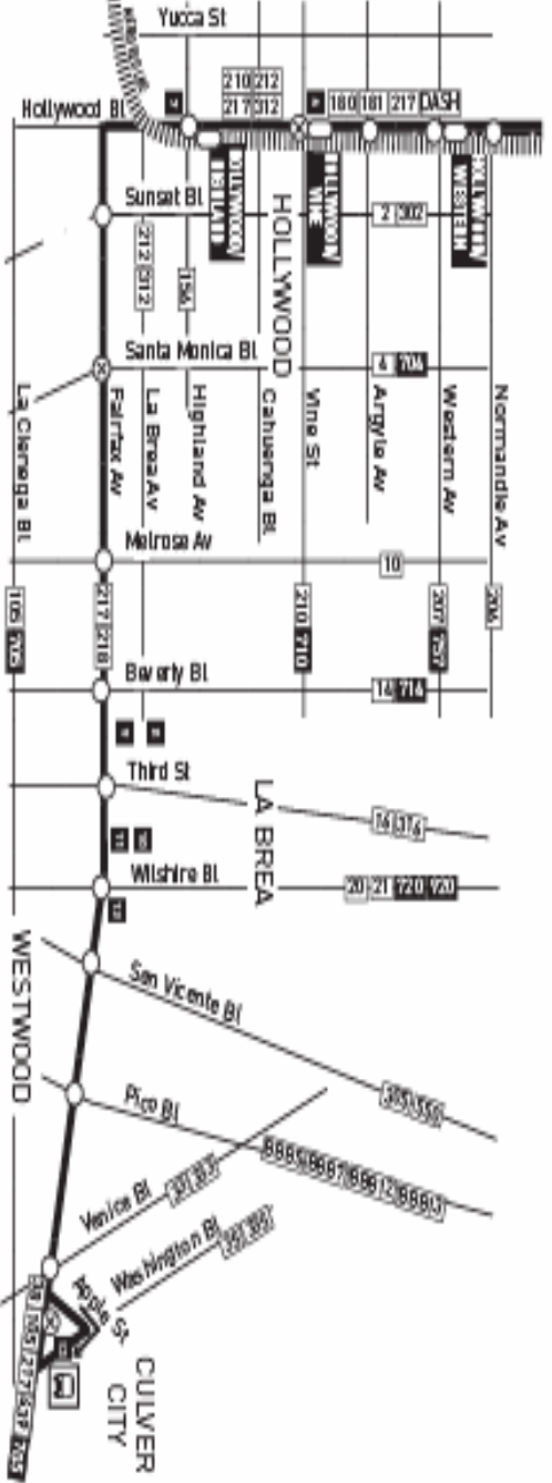
INSET 1 - HOLLYWOOD - WEST LA TRANSIT CENTER