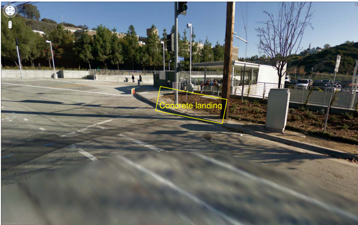
Exhibit 3 Proposed Bus Stop Location Nearside Sepulveda at Bergreen

The Skirball Center has committed to constructing an ADA compliant concrete landing at the proposed bus stop location provided Metro commits to continuing service to the center during the I-405 Sepulveda Pass project construction (unless construction prohibits), estimated to be 3 years. In addition, the Skirball Center will actively market and promote the use of bus service to the center and neighboring institutions such as the American Jewish University with the goal of achieving 120 boardings per day at the stop within one year. Currently 63 passengers board per day at the existing stop location.