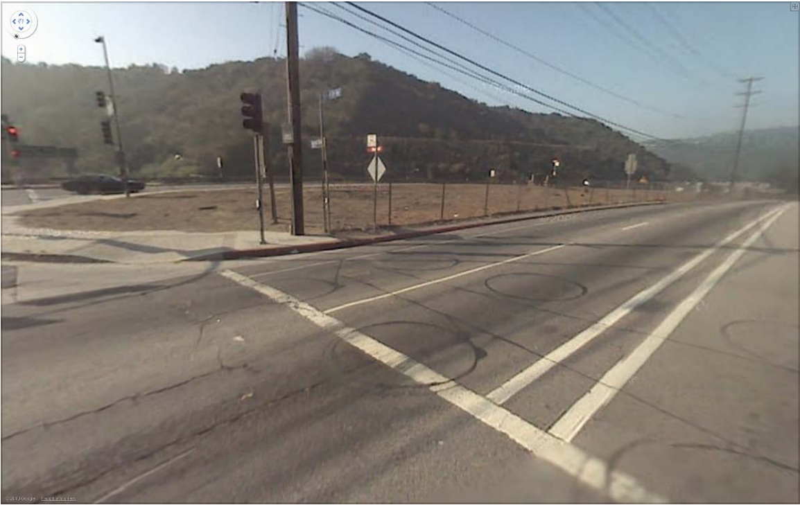
Exhibit 2 Location of Existing and Proposed Bus Stop