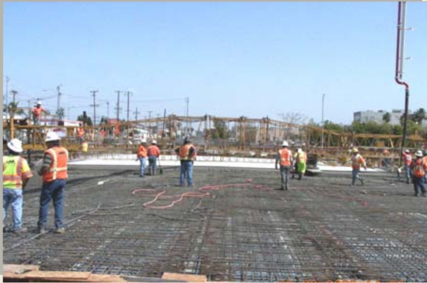
Concrete Deck Pour at National Boulevard Bridge