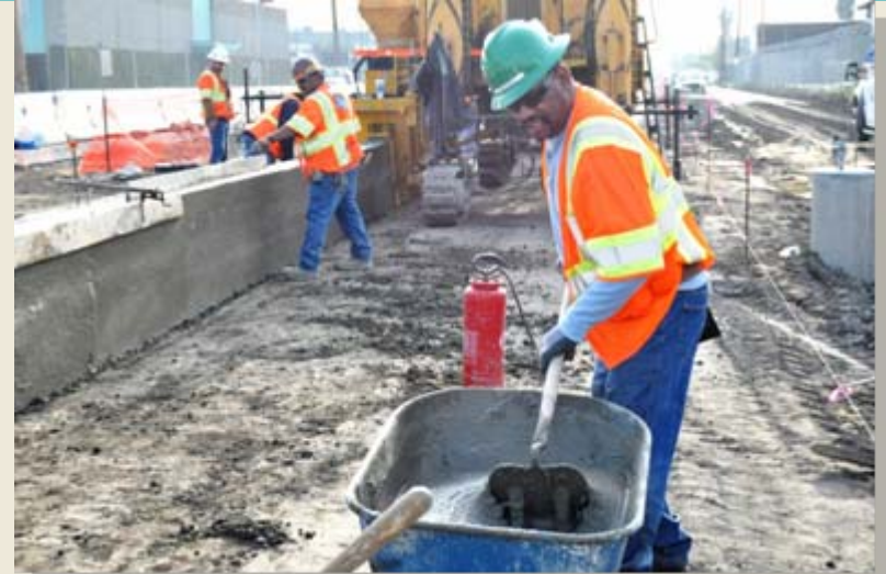
Construction of ballast wall for track bed