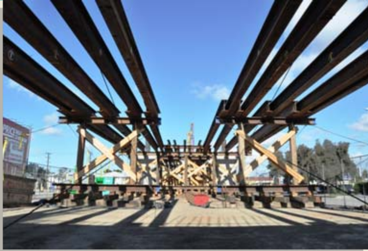
Falsework at La Brea Aerial Station