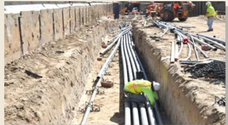
Conduit installation at the Expo Park/USC Station