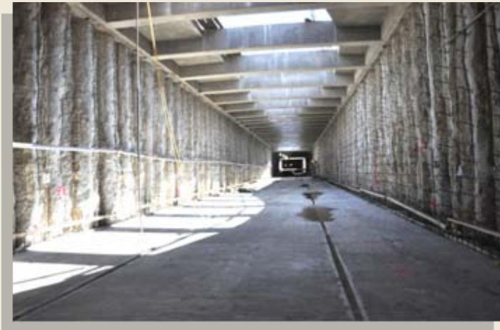
Inside of the trench