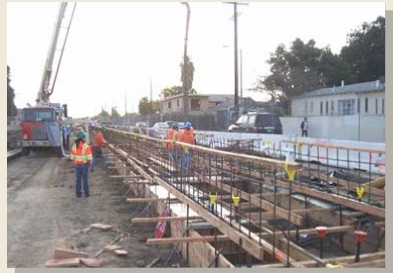
Construction of the Western Station