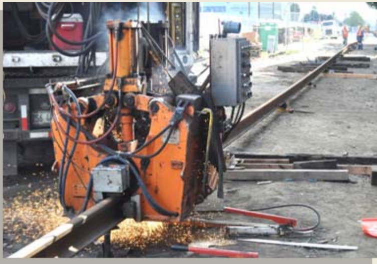
Welding of rail near La Brea Station