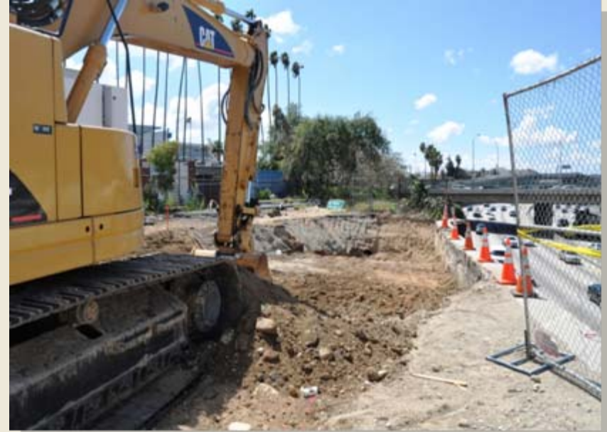
Work near the Adams Street Bridge over the I-110