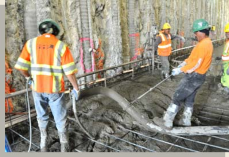
Pouring of the invert slab inside of the trench