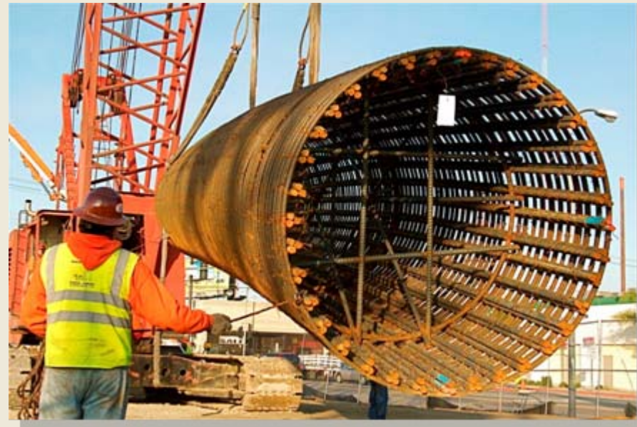
Installation of CIDH piling at La Cienega