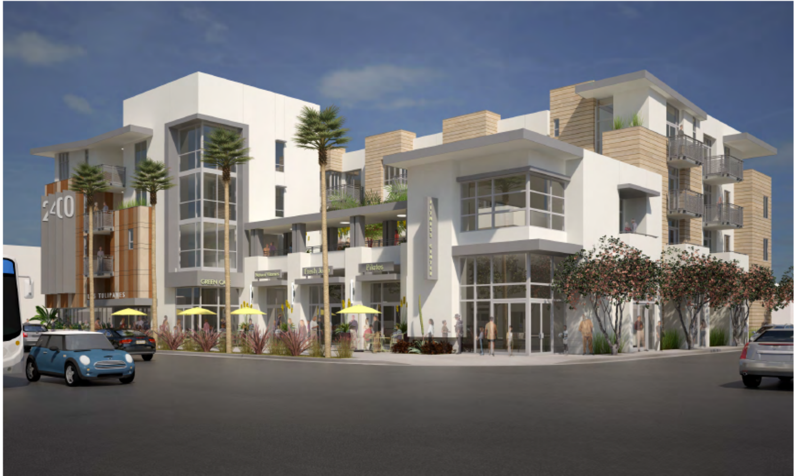
VIEW OF BUILDING FROM NORTH / WEST

SOTO STATION JOINT DEVELOPMENT LOS TULIPANES AFFORDABLE SENIOR HOUSING/ MIXED-USE