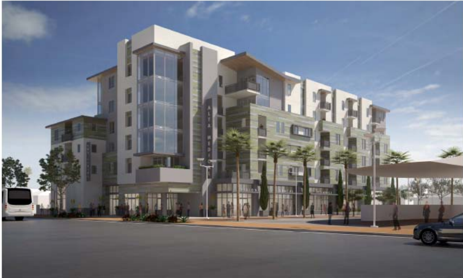
VIEW OF BUILDING FROM NORTH / EAST

SOTO STATION JOINT DEVELOPMENT LAS MARIPOSAS AFFORDABLE FAMILY HOUSING/ MIXED-USE