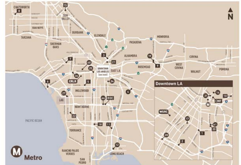
Metro Operating Divisions and Other Major Facilities

Training Module for Next Generation Leaders