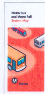
New System Map